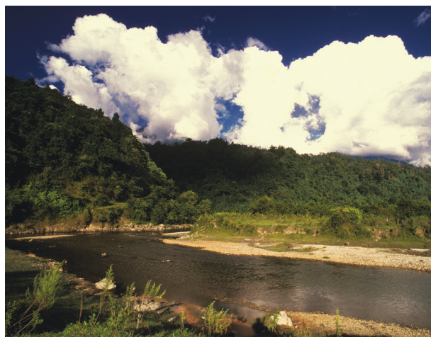
Fig. 3 Habitat of Trimerodytes percarinatus at Namdapha, India.