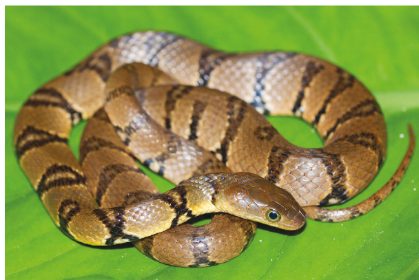
Fig. 1 Full body picture of Trimerodytes percarinatus from Namdapha, India.